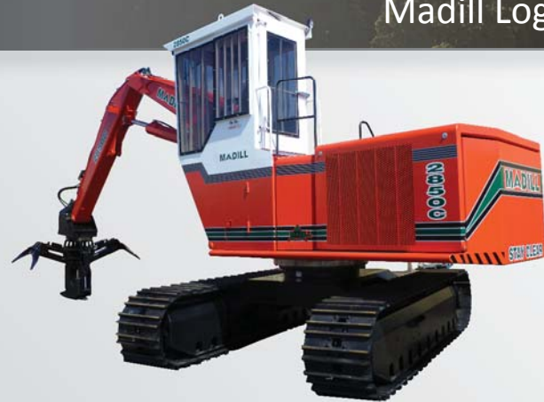
Image: Madill 2850C with Butt N Top